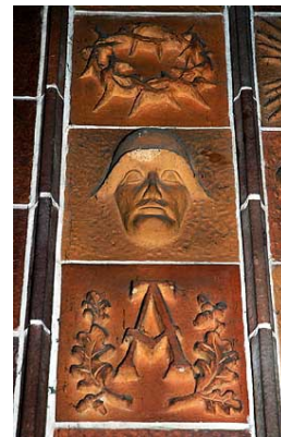
The soldier is located just below Jesus' crown of thorns