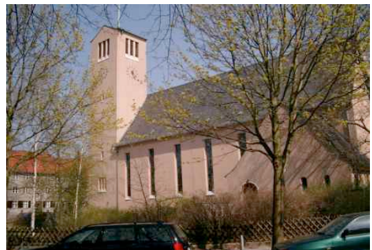
The Martin Luther Memorial Church

In 1935, just two years after they came to power, the Nazis built an imposing church in Mariendorf (south Berlin) dedicated to Martin Luther.