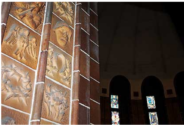
The stone carving on the arch surrounding the chancel of the church (where the alter is located) contains a helmeted Nazi soldier