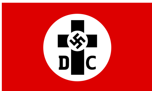
Deutsche Christen Flag