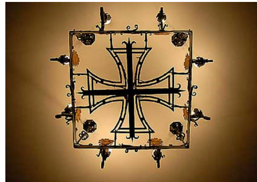
An Iron Cross Chandelier (formerly containing a swastika) was placed inside the entrance of the church