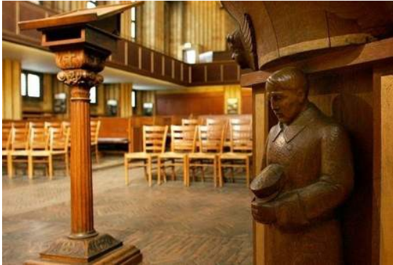
The baptismal font contains a carving of Adolf Hitler holding a stormtrooper hat

The spiritual connection between Martin Luther and The Third Reich was expressed throughout the church.