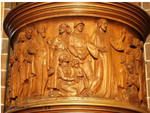
The Pulpit contains a depiction of Jesus with a Nazi soldier