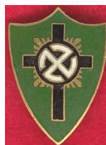
Deutsche Christen Badge