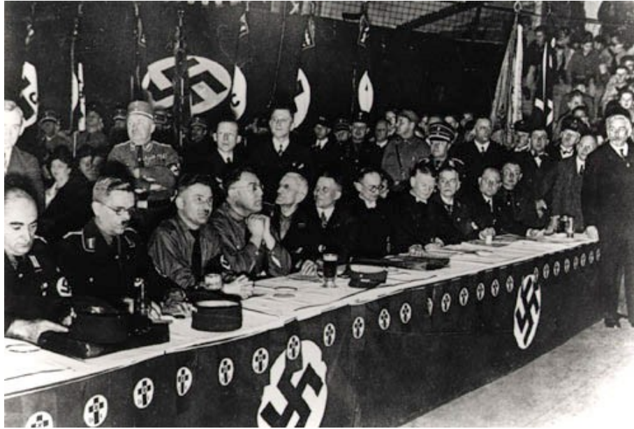
Presidium of the Deutsche Christen Lutherans Berlin, November 13, 1933